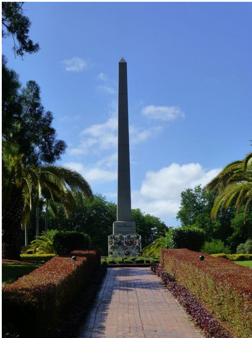
Rockhampton War Memorial

The Rockhampton War Memorial, located in Botanic Gardens, 100 Spencer Street, Rockhampton, Queensland does not list individual names.